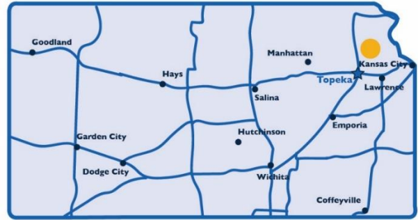
USD 340 Jefferson West

Invites candidates to apply for the position of MIDDLE SCHOOL PRINCIPAL