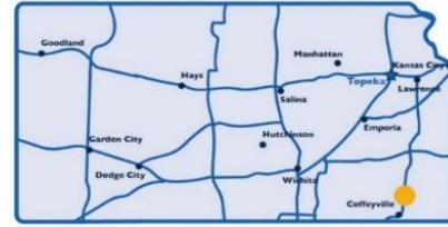
USD 447 Cherryvale