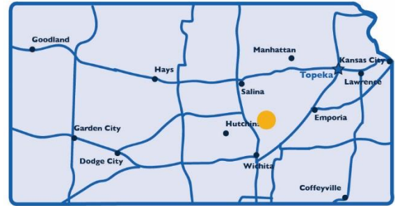
USD 398 Peabody-Burns